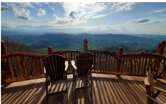
Photo: View from High Mountain Camp.

2025 Property Owner's Meeting will be held on 8/23/2025 at 12:00 pm at High Mountain Camp.