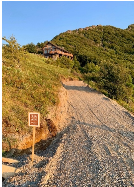
Photo: Multi-purpose Trail.